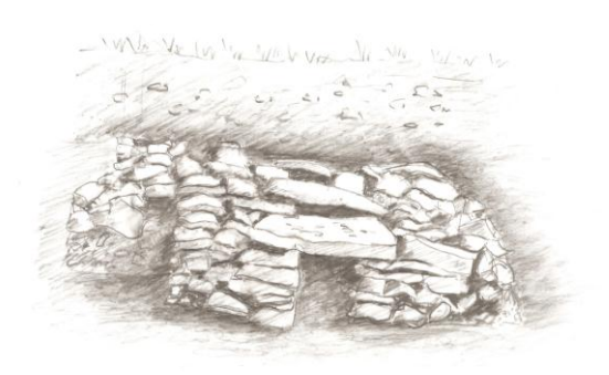
Drawing by Diana Warmington