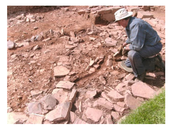
Trench 5: One of the curving gullies is seen here right of centre.

After removing layers of 18<sup>th</sup>/19<sup>th</sup> century debris, quantities of random stone and a layer of charcoal blackened silt, Trench 5 finally revealed possible yard surfaces on either side of the remnants of a heavy stone wall which may represent a NE-SW boundary shown on the tithe map of 1840. The wall peters out into a band of clean red clay, the stone having been largely robbed out. What we are seeing may be part of the stone base of a cob wall. There was a very definite wet gulley along the eastern edge of the robbed out wall, which was covered with stones. Both to the west and to the east of the wall were possible yard surfaces of packed small stones with random stake- or post-holes; the stones to the east had abraded edges showing wear. Set within or beside this surface were two narrow, curving stone-lined gullies covered with flat stones, presumably intended to provide drainage. On the final day of cleaning up in September, after the rain, a small pit was noted in the edge of the west section. The trench was finally drawn and recorded and covered with terram to be backfilled by the owners.