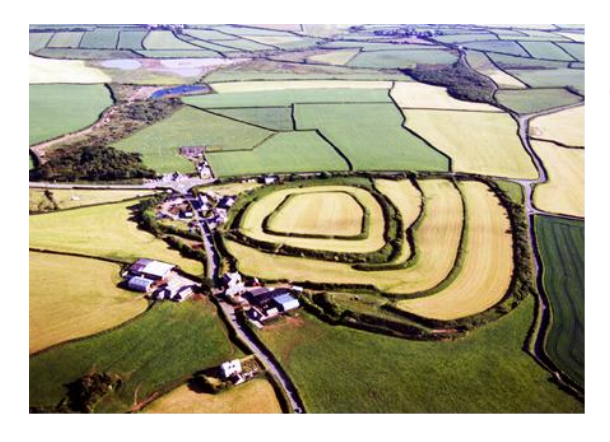
Clovelly Dykes from the air.

If you're driving on the A39 towards Hartland, you pass the site on your right between Clovelly Cross and the turning to Hartland. Or if you turn right into Clovelly you pass through the site with the main body of it on your left. But you don't see anything because of the high hedges and because the three kilometres of banks and ditches and the 8.09 hectares that they enclose lie on a flat hilltop. Seen from the air however, this is clearly a very impressive piece of work.