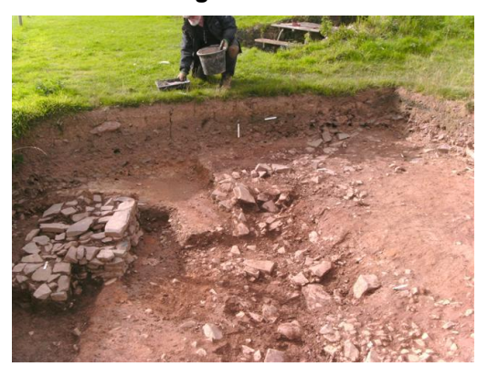
Trench 4: The "toilet" structure is on the left, the drain/gulley cutting the clay is above centre right

The structure found in the south of T4 in 2010 was fully excavated and is quite possibly a medieval(?) toilet! Well constructed with coursed stone and large flat stones on top (with a gap between them, perfect for the purpose, but not very comfortable), there is a channel underneath, blocked at the south end by a vertical stone on a stone pad. This neat structure sits within a feature which is cut into the natural clay and which has yet to be investigated.